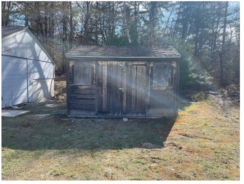
ARTICLE 12 - Improvements to Storage Sheds at Larter Field: To see if the Town will vote to transfer from available funds, including CPA funds, a sum of money to make improvements to the storage sheds at Larter Field, based upon the recommendation of the Community Preservation Committee, or take any action in relation thereto.

The Community Preservation Committee has recommended appropriating $9,640 from the Open Space/Recreation Allocation to support the renovation of the storage sheds at Larter Field. The project includes an upgraded garage door, and general renovations to the snack shed, rear storage area, and small irrigation shed. These sheds are used to store equipment and supplies to maintain the field and to support the sports teams, and Parks and Recreation.