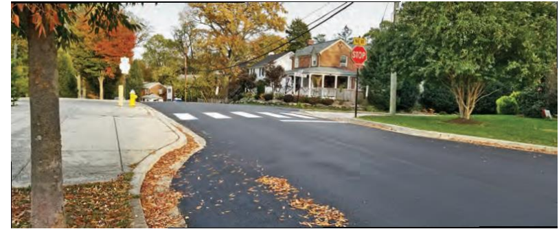
Curb extension or bulb-out