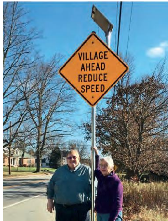
Flashing traffic signs