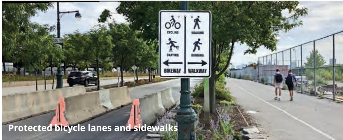
Protected bicycle lanes and sidewalks