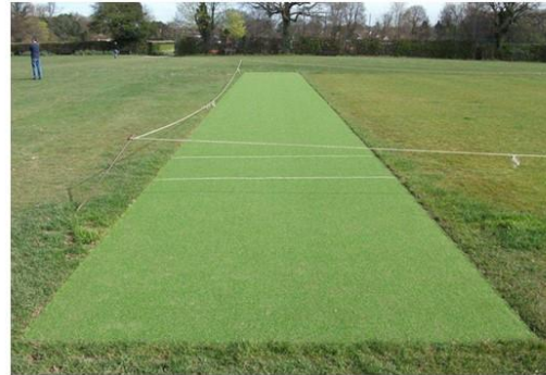
Astro turf / concrete area sample pic Approx 10-11' x 100' (ft)